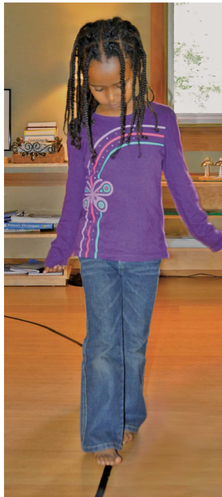
Fig. 3. Walking meditation in Montessori can be simply walking on a line (which required focused attention and concentration for young children) or walking on it without spilling water in a spoon or without letting your bell ring.

Montessori (36) curriculum does not mention EFs, but what Montessorians mean by “normal-