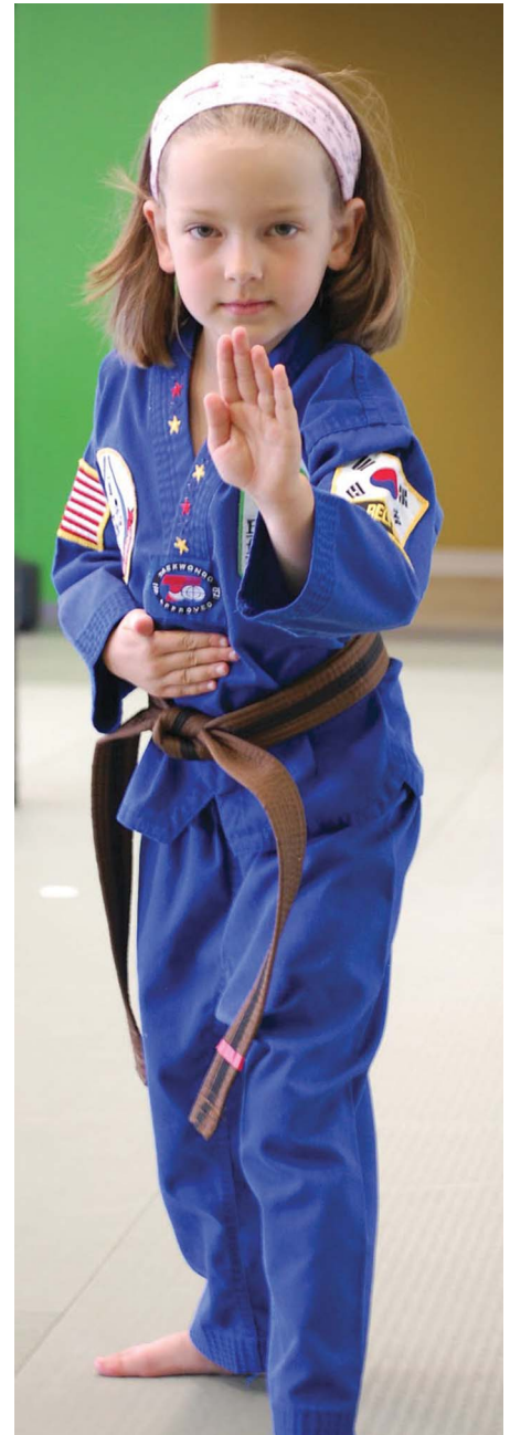
Fig. 2. A child demonstrating a tae-kwon-do stance. [Photo credit: Haiou Yang]

Martial arts and mindfulness practices. Traditional martial arts emphasize self-control, discipline (inhibitory control), and character development. Children getting traditional tae-kwon-do training (Fig. 2) were found to show greater gains than children in standard physical education on all dimensions of EFs studied [e.g., cognitive (distractible-focused) and affective (quitting-persevering)] (28). This generalized to multiple contexts and was found on multiple measures. They also improved more on mental math (which requires working memory). Gains were greatest for the oldest children (grades 4 and 5), least for the youngest [kindergarten (K) and grade 1], and greater for boys than girls. This was found in a study where children 5 to 11 years old were randomly assigned by homeroom class to tae-kwon-do (with challenge incrementing) or standard physical education. Besides including physical exercise, martial-arts sessions began with three questions emphasizing self-monitoring and planning: Where am I (i.e., focus on the present moment)? What am I doing? What should I be doing? The later two questions directed children to select specific